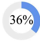
% Meeting Achievement Target