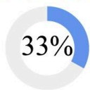
% Meeting Achievement Target